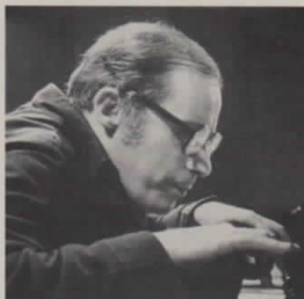
Gould at play the year before his death

Wit, misfit and eccentric, Glenn Gould was one of the most provocative pianists of the century. In 1964, after an international concert career that had lasted only nine years, he abruptly retired from the stage to explore the potential of the recording studio. In more than 90 releases, ranging from two idiosyncratic versions of Bach's "Goldberg" Variations to his transcriptions of Wagner, Gould did just that. Flamboyant willfulness marked too much of his work, but at his best he had a penetrating, furiously original vision.